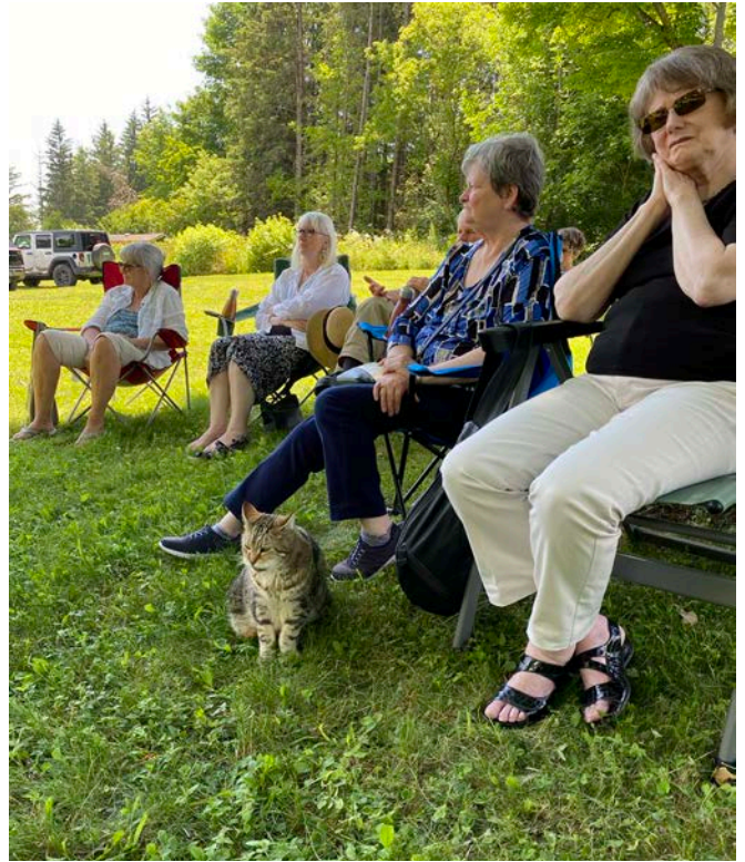
Tigger visited just about everybody at the outdoor concert