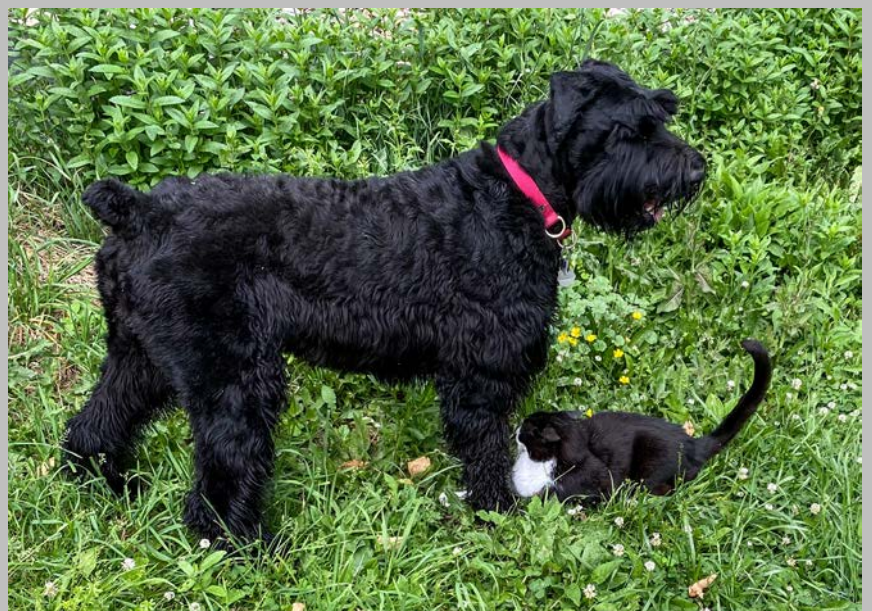
Roxy and Sparkle the cat Bergman