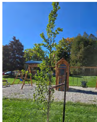
Birch tree in memory of Connie Neelands