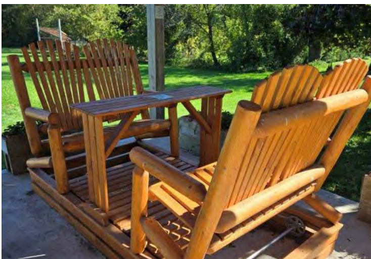
Gliding bench dedicated to the memory of Andy Neelands